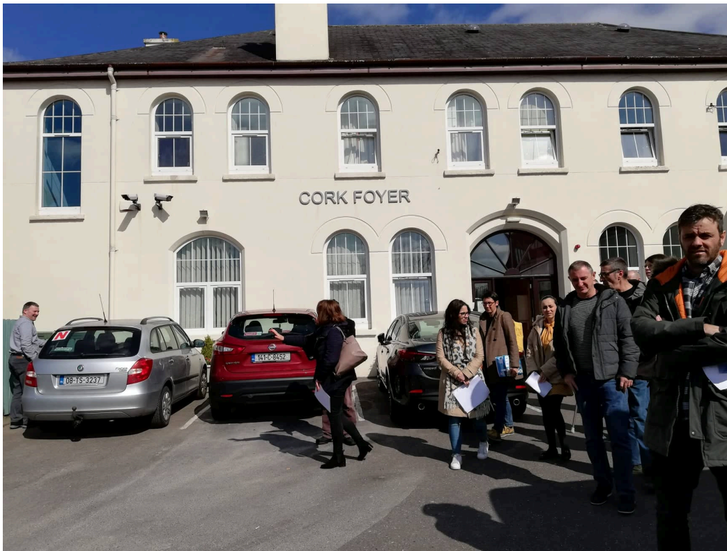
Figure 1 - Entrance of Cork Foyer facilities