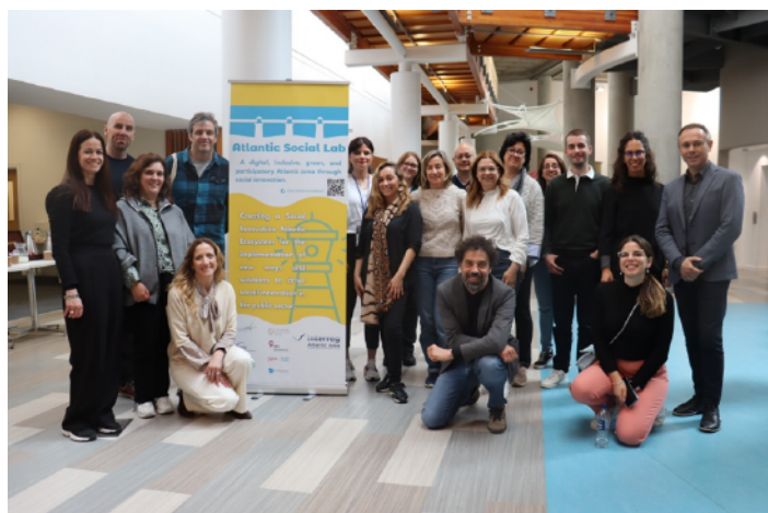
Atlantic Social Lab Partnership at Glasgow Caledonian University

The final conference of the extension phase of the ASL project took place in Glasgow on 18-19 May and was organised by Glasgow Caledonian University. The conference was integrated into the "Second Changemakers and Pioneers: Social Innovation Fair".